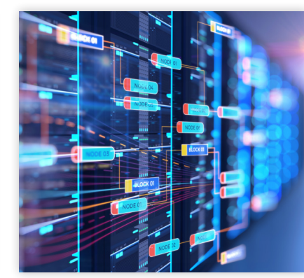
State-of-the-art Advanced Technology Center (ATC) enables proofs of concept, testing, scaling