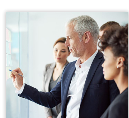
Strategy through Execution Services for a holistic approach to your biggest security challenges